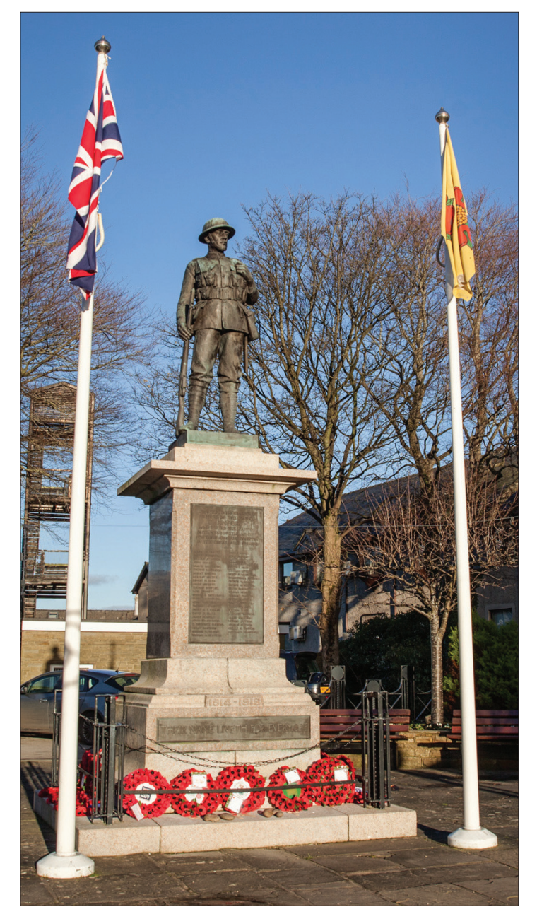
Carnforth War Memorial, unveiled 9 November 1924

On the 100th anniversary of the end of World War One, this leaflet commemorates those men who never came back. It also remembers those that they left behind. Not all families received a telegram from the King during the war telling them of the death of a loved one as in some cases wounded men died well after the end of hostilities but the effect was no less tragic on grieving households.