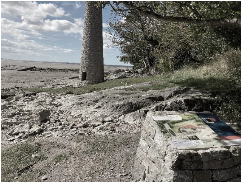
Figure 1: The plinth and chimney at Jenny Brown's Point, Silverdale

Mourholme Local History Society, working with the Morecambe Bay Partnership, Arnside Silverdale AONB and Natural England, has provided an Interpretation Panel, placed on a small limestone plinth, for one of the most distinctive coastal landmarks in our area - the Chimney at Jenny Brown's Point in Silverdale.