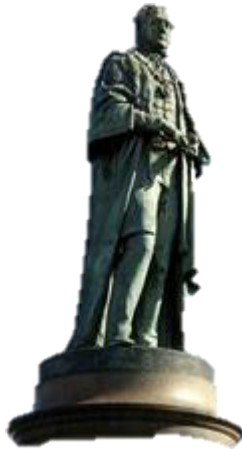
Figure 1, Henry Schneider's statue, Duke Street, Barrow-in-Furness

In 1867 a Parliamentary investigation found that voting in Lancaster was so corrupt that its two MPs were kicked out of office. For nearly 20 years electors were deprived of the vote.